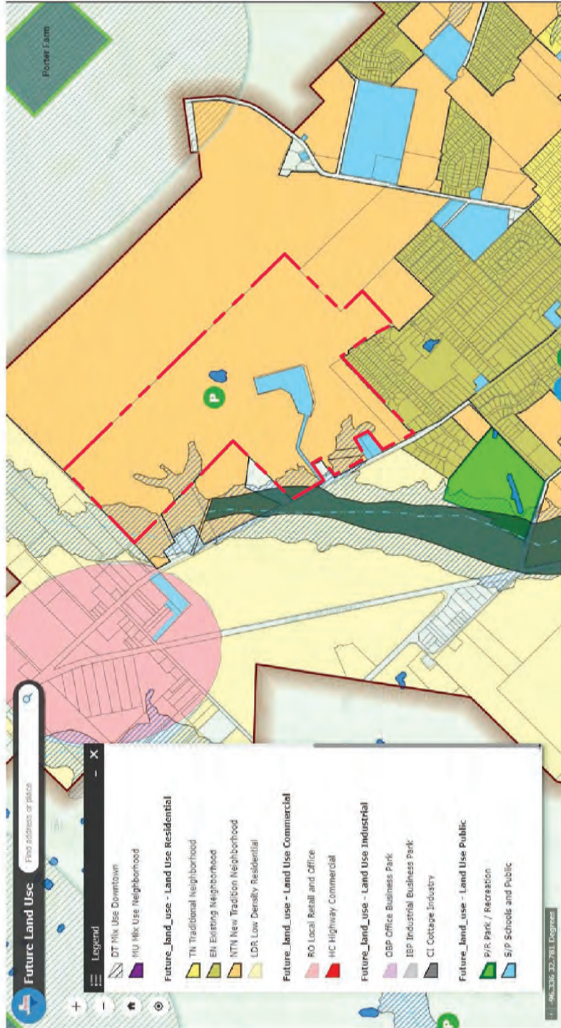
EXHIBIT E GRIFFITH TRACT FUTURE LAND USE EXHIBIT TERRELL, TEXAS June 2021