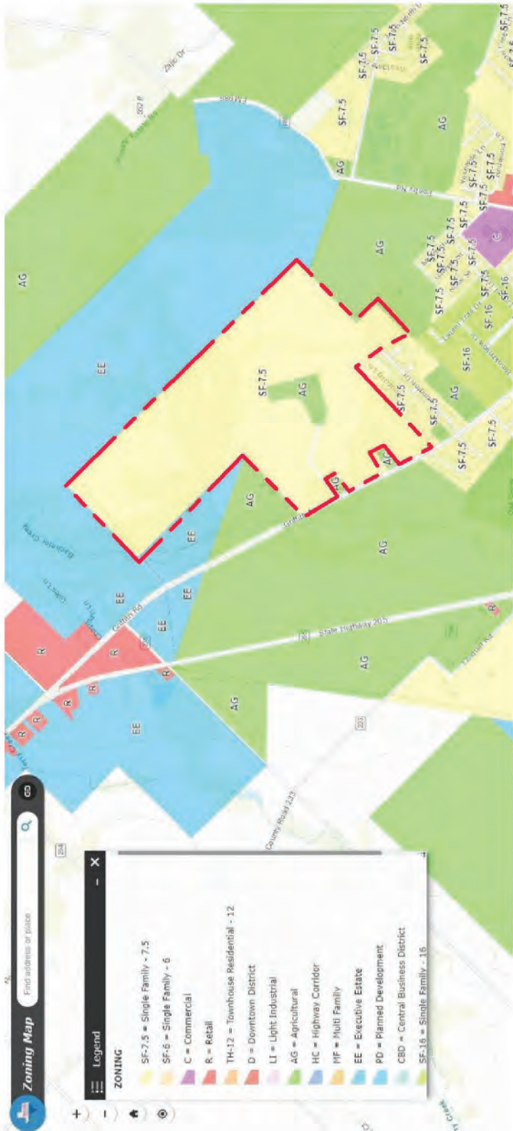
EXHIBIT D GRIFFITH TRACT ZONING EXHIBIT TERRELL, TEXAS June 2021