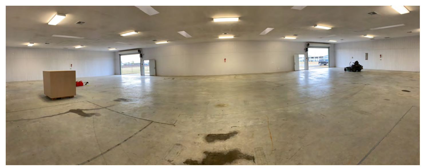
**Information contained herein was obtained from sources deemed reliable; however, Scott Brown Commercial and/or the owner(s) of the property make no gurantees, warranties, or representation as to the completeness or accuracy thereof. The presentation of the property is offered subject to errors, omissions, changes in price and/or terms, prior to sale or lease or removal from the market for any reason without notice.**