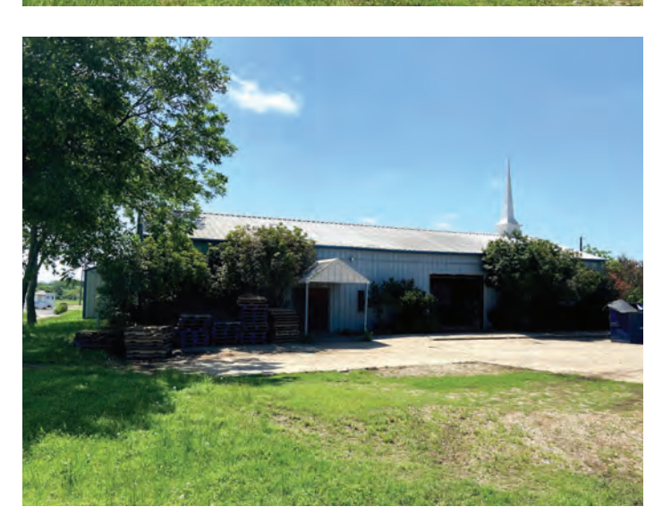
**Information contained herein was obtained from sources deemed reliable; however, Scott Brown Commercial and/or the owner(s) of the property make no gurantees, warranties, or representation as to the completeness or accuracy thereof. The presentation of the property is offered subject to errors, omissions, changes in price and/or terms, prior to sale or lease or removal from the market for any reason without notice.**